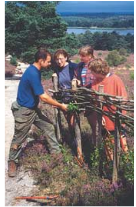
Top: Estate worker building dead hedge at Frensham with visitors watching