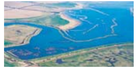
Top: Coastal realignment at Abbots Hall, Essex. Breaches in the seawall allow seawater to flood former arable land. New salt marshes are rapidly establishing, providing sea defences and wildlife habitats